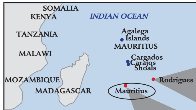
Figure 3 Location of Mauritius in the Indian Ocean

Tourism is the main economic activity of the island in terms of income generation, employment creation, and foreign exchange earnings (Mehmet and Tahiroglu, 2002). Mauritius is basically a beach destination and to diversify from the typical sea, sun and sand (3S), nature and culture, are also exploited in the tourism marketing